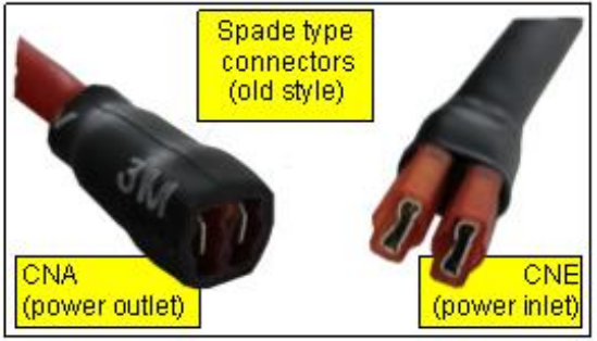
Figure 1. Connector types. DT series connectors replace Spade type. Standard configuration: Power lead fitted with DT socket connector and load/receiving side configured with DT pin connector. Polarity: 1 – Black or Gray wire, 2 - White wire.

Caution: System must be disconnected from power. Do not connect power before performing Functional System Check with ohm meter per system ICA.