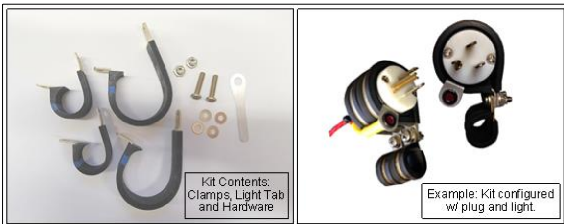
Figure 1. Bracket Kit p/n: TU03345. For parts listing ref to Bracket Kit drawing: 03345. Use supplied hardware and clamps to position plug and light in accessible location on engine mount, baffle, or other. When required substitute clamps as needed to obtain secure fit.

Inspection is the only form of required service. Inspect for security of attachment, fluid damage and wear. Correct discrepancies as required, refer to TCA1000.