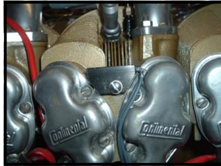
TAS76 ON CONTINENTAL -360 CYLINDER