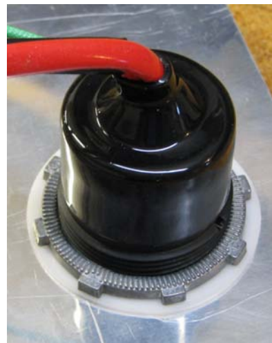
Rear view of mounted power plug.