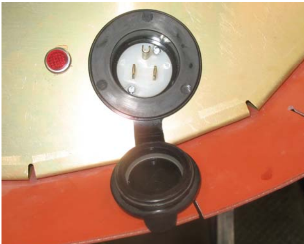
Power plug mounted in baffle with cap open.